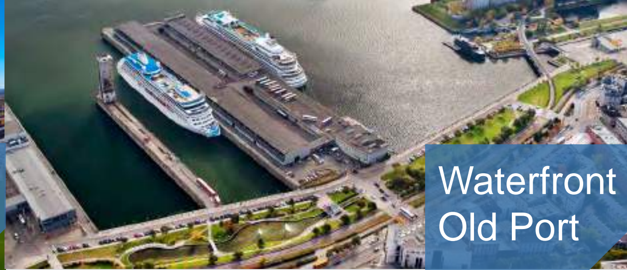
Waterfront Old Port