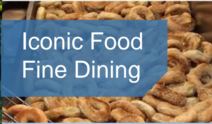
Iconic Food Fine Dining