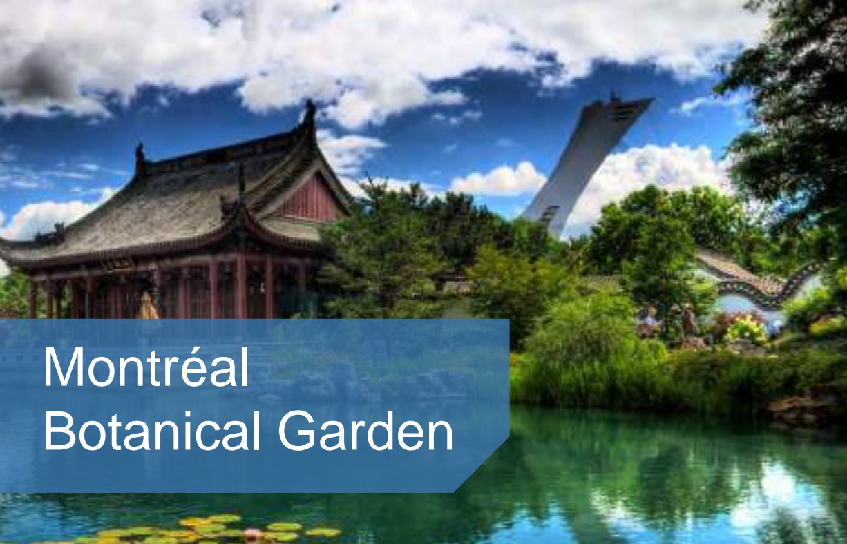
Montréal Botanical Garden